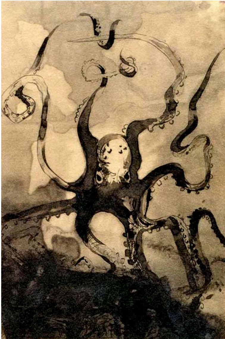
Pieuvre avec les initiales V.H. (Octopus with the initials V.H.) Victor Hugo, 1866