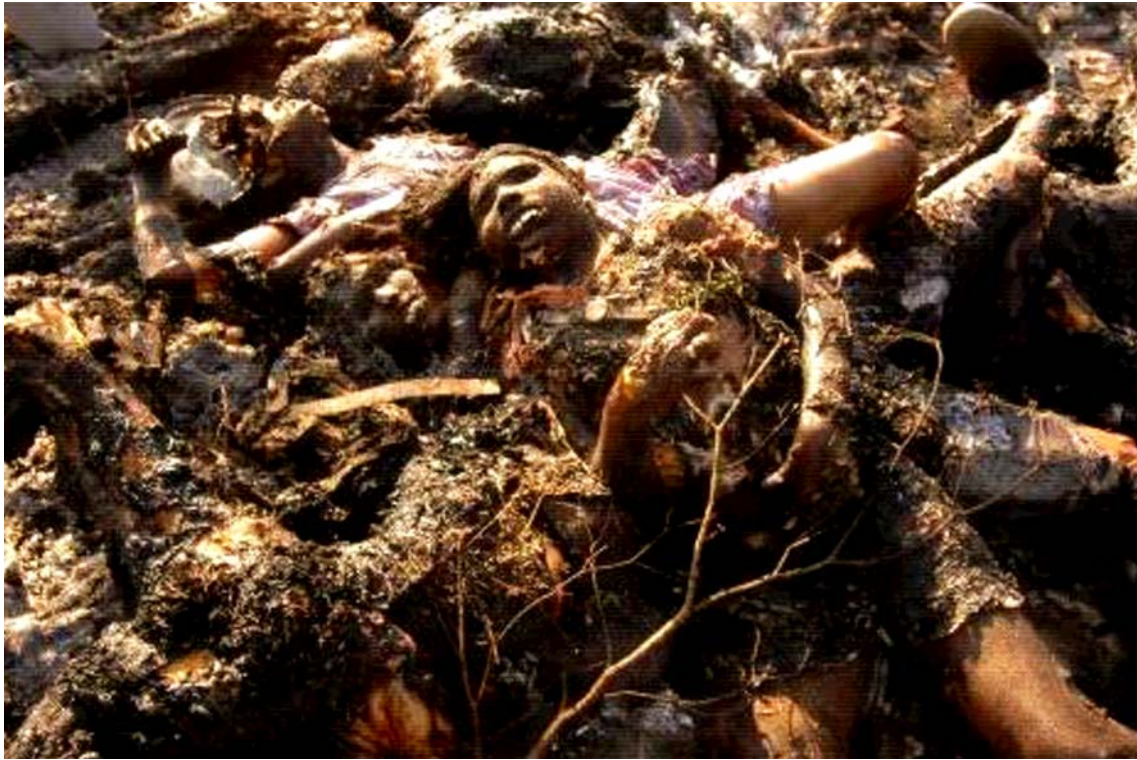
CAUTION!!!! Weak Heart DO NOT SEE... Unknown (via email), 2009