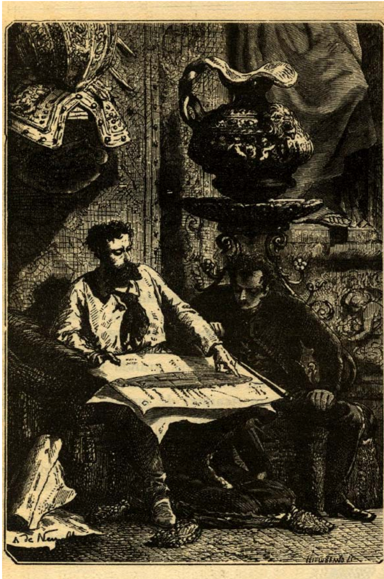
Captain Nemo and Professor Aronnax discussing the plans of the 'Nautilus' Alphonse de Neuville and Édouard Riou, 1869