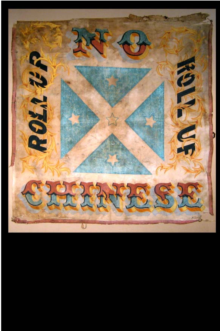
Lambing Flat Banner